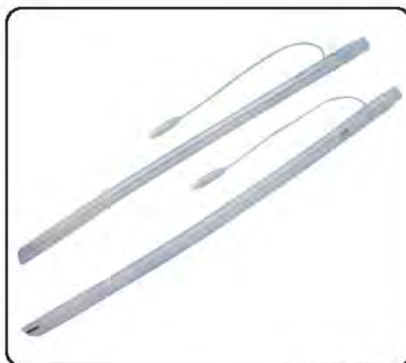
Y1065 • Y1066