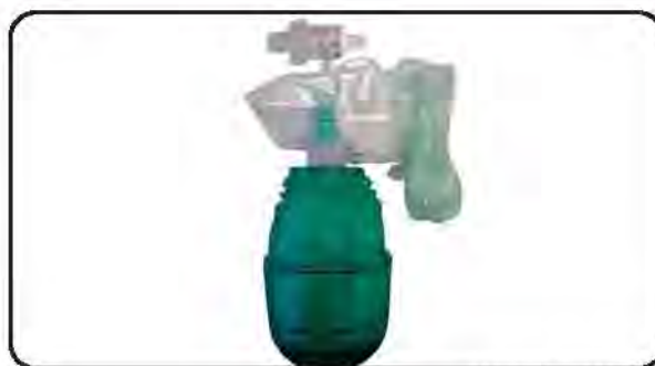
Y1075 • Y1076