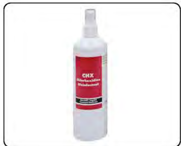
CHX Chlorhexidine Disinfectant