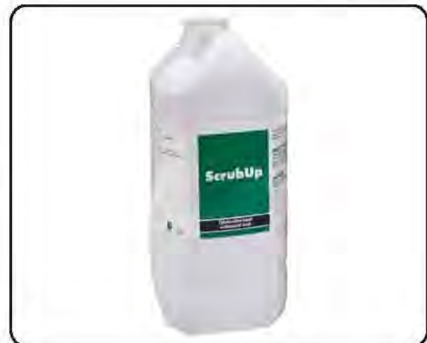
ScrubUp Liquid Soap