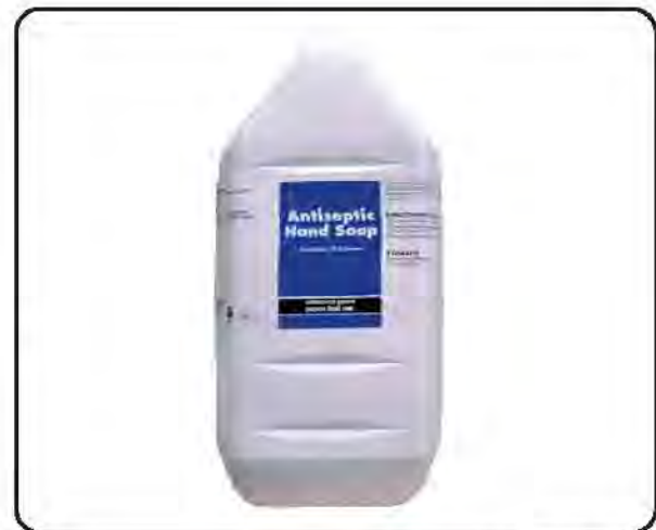
Antiseptic Hand Soap