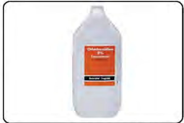
Chlorhexidine 5% Concentrate