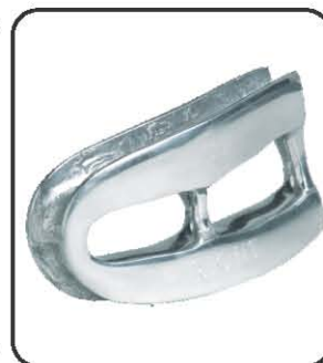
Y1900 • Y1901